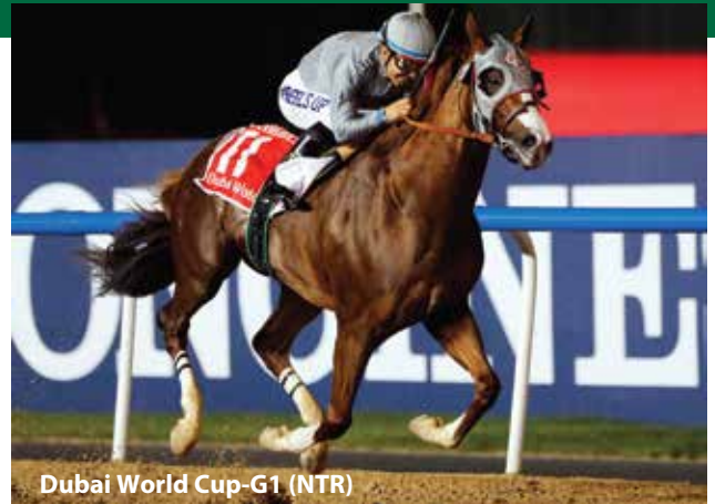
Dubai World Cup-G1 (NTR)

Following California Chrome's record-breaking victory in the Dubai World Cup-G1 on March 26, Lucky Pulpit's progeny earnings of $6.7 million surpassed Unusual Heat's 2008 California progeny earnings record of $5.8 million. For statistics through November 5, progeny earnings of $10,395,828 ranked Lucky Pulpit fourth on the 2016 General Sire list ahead of big ticket stud fee notables Medaglia d'Oro , Unbridled's Song , Bernardini , Giant's Causeway , Scat Daddy and Distorted Humor .