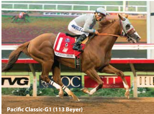
Pacific Classic-G1 (113 Beyer)

Traveling the world again in 2016, California Chrome won six consecutive graded races including a new track record in the Dubai World Cup-G1 and a five-length score in the Pacific Classic-G1 conquering racing's best and becoming North America's all-time leading money winner.